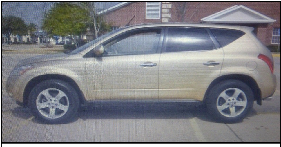
Suspect Vehicle Stock Photo—2003 Nissan Murano

The Loudoun County Sheriff's Office is investigating a Home Invasion Robbery that took place on Tuesday, April 16, 2013 around 10am in the 13400 block of Loyalty Road in the Taylorstown area. According to the victims, four males entered the residence and brandished weapons. The victims were held against their will while the intruders removed items from the home.